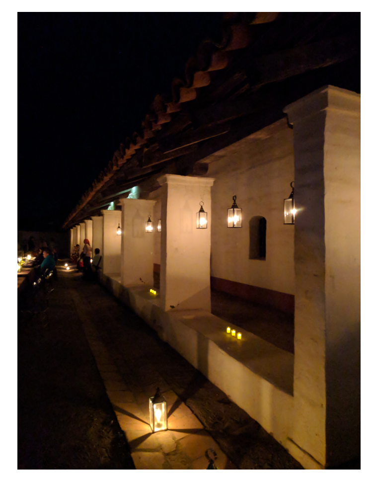
Photo: La Purísima Mission at night, 2017.

(805) 733-3713 <u>www.lapurisimamission.org</u> <u>www.facebook.com/</u> <u>PreladodelosTesoros/</u>