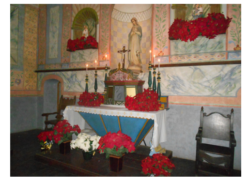
Photo: Founding Day church decorations, 2017.