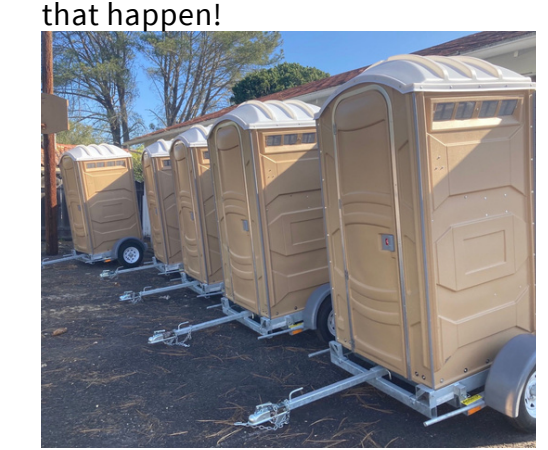
Photo: New Porta-potties are available for school groups & special events.

Our new porta potties were delivered and our Maintenance Crew got them all assembled and ready for use. Thank you to Prelado de los Tesoros for making