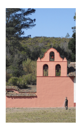
Prelado de los Tesoros La Purísima Mission SHP 2295 Purisima Rd. Lompoc, CA 93436

(805) 733-3713 www.lapurisimamission.org