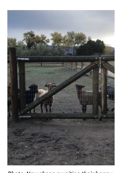
Photo: New sheep awaiting their happy meal. Photo by Colleen Newkirk

folks were super helpful. We absolutely love the new additions to the flock. They are so sweet and friendly! I made sure to choose a variety of wool colors so we could have different yarn colors for mission projects. They were nine months old in December with the exception of a six year-old. She didn't get along with