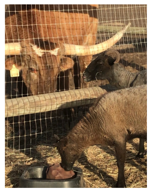
Photo: Adobe is very curious about the new sheep.