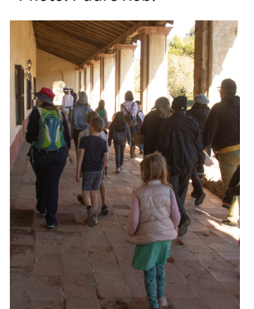
Las Posadas