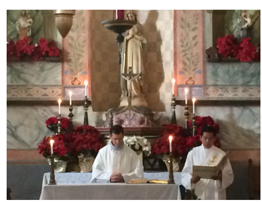
Photo: A priest from Vandenberg Space Force Base and deacon from La Purísima Church celebrate Mass.