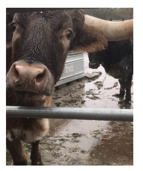
Photo: Adobe and Pismo hanging out at the fence line during feeding time.

Steers Pismo and Adobe have settled down nicely! They know their feeding routine so any initial aggressiveness (in the early weeks) related to wanting food as we walk through their corral to feed sheep and pigs has diminished. But we're still on the lookout. They are inquisitive and go to the side fences to check out visitors and dogs.