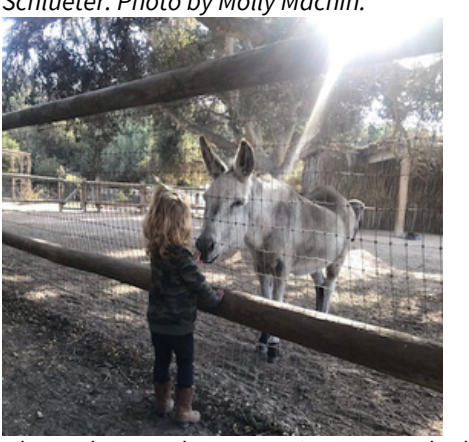
Photo: the next day Mamacita went to donkey heaven.