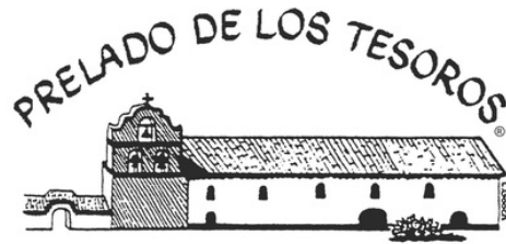
La Purisima Mission State Historic Park