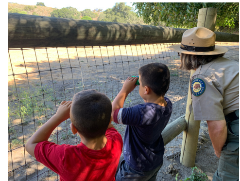
Photo: Junior rangers explore who made that hole?