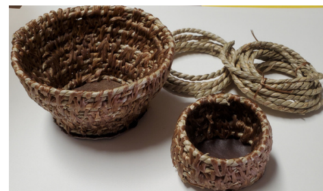
Photo: baskets sold in La Tienda.

Attention Crafters: we can use your help. The Tienda is Prelado's main fundraiser and we are always in need of Crafters. The crafts sold in La Tienda are easy to make and we will supply materials and get you trained. Join in the fun and be part of the team of crafters. Stop by to see where you can help!