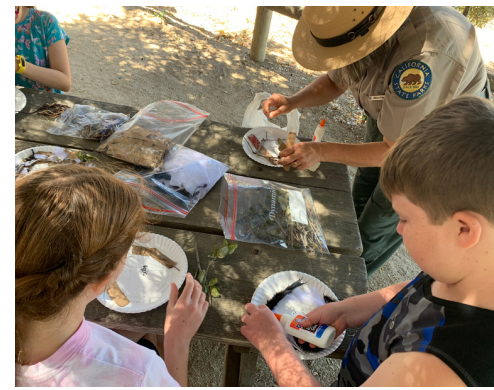
Photo: Junior craft class.

It had been two years since Kid's Camp was held. This year's program was a great success and was also wait-listed. Ultimately, we had eighteen kids from the Lompoc community attend.