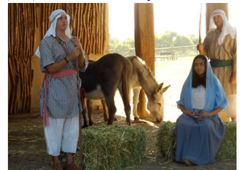
Photo: Las Posadas, 2019.