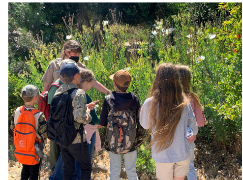
Photo: Kids Camp.