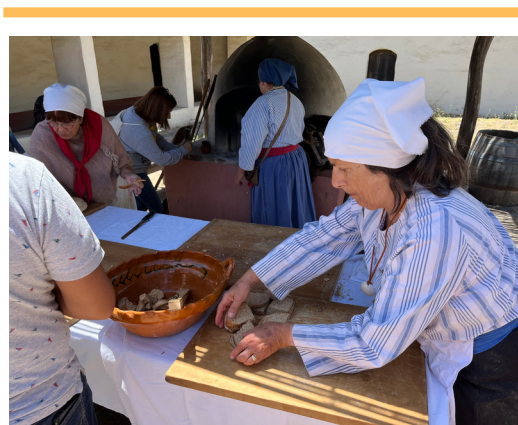
Photos: (top & bottom) Docents making bread at the July Mission Life Day.