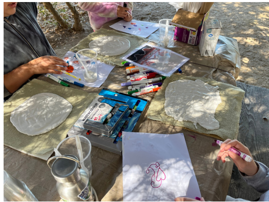
Photo: Junior Fresco painting class.