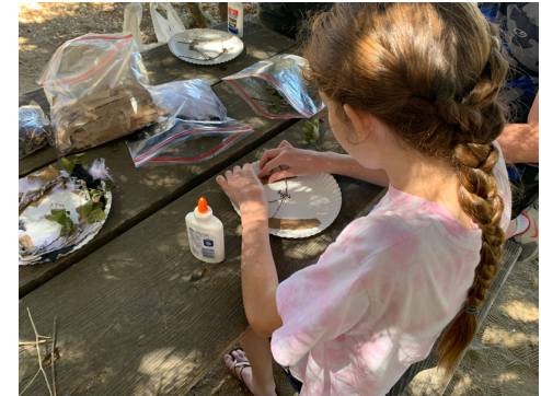
Photo: Junior craft class.

If you know of anyone looking to join in the fun, we plan to have a docent training class this fall, although no dates are confirmed yet. Stay tuned!