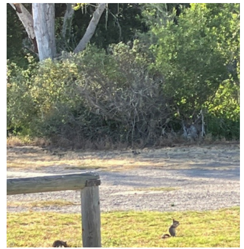
Photo: Baby Ground squirrel enjoying a snack.

Let's start with Pocket gophers. They're the little buggers that make the perfectly round little holes. They're called "pocket" gophers because they have fur-lined pockets as well as cheeks. These pockets extend all the way back to their shoulders and the gopher fills them with plant material to carry back down to their burrows. They dig their tunnels, and all those holes , in search of food and a mate. They have very poor sight and hearing, but an excellent sense of smell and very sensitive whiskers and tail hairs (for walking backwards through tunnels). Basically, they will smell food (almost any kind of plant) and using mostly their teeth, burrow towards it. They'll pop up out of the ground, eat everything around the hole, even venturing their body's length away, then cover the hole with a 'plug' of dirt and work their way towards the next whiff of vegetation. They are able to wrap their lips around their teeth so they don't get mud in their mouths while they're digging. Pocket gophers will eat any part of the plant and are known to tug plants into their holes, down to their burrows to enjoy later. The nesting area of the