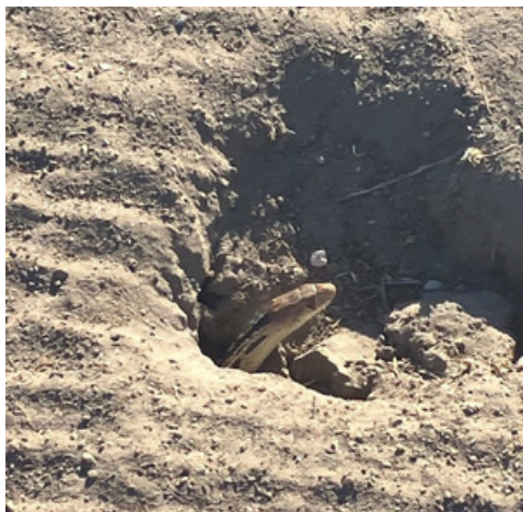
Photo: A Gopher snake greeting the day.

Instead of digging straight down, Ground squirrels prefer to dig into an embankment. They also have pretty good vision, possibly close to humans. They have a couple of characteristic poses, including the "meerkat." Instead of hibernating like some squirrels do, our Ground squirrels will "estivate" when it gets very hot. Basically, going deep in their burrows and taking a nap until it cools off. Mother Ground squirrels have anywhere from three to eleven pups, and I think probably the cutest thing I've seen in more than half a century are the baby Ground squirrels at La Purísima in the spring when they finally leave their burrows for the first time. There was about a month in the spring when, if you looked across the fields in front of the mission, it seemed like there were a million teeny little baby squirrels just going crazy and jumping around like popcorn. But I have to remind the fourth-grader in me about the circle of life. Seventy percent of a rattlesnake's diet in the spring are baby Ground squirrels.