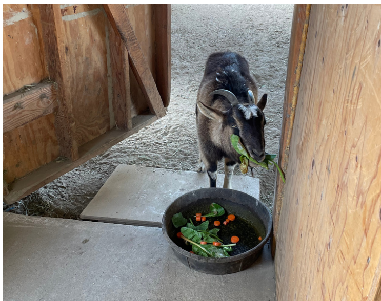
Photo: Farewell to Goatie.

(805) 733-3713 www.lapurisimamission.org