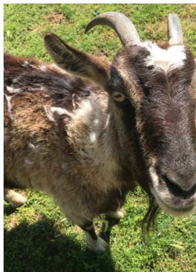
Photo: Goatie molting.