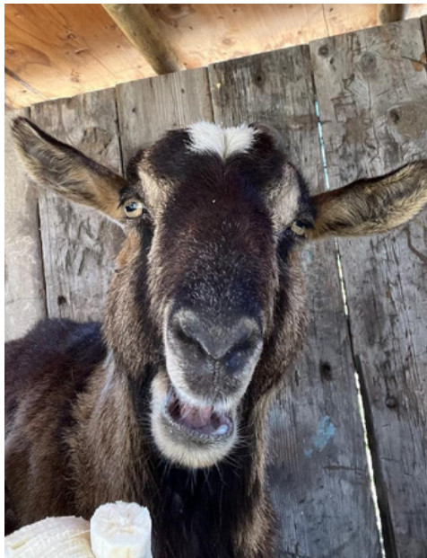
Photo: Goatie certainly had her own personality.