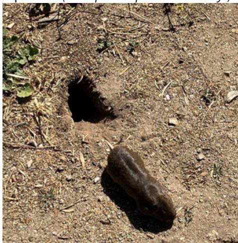
Photo: Pocket gopher stretching out of his hole to grab ruderal vegetation.

There are two main makers of holes here at La Purisima: Ground squirrels ( Otospermophilus beecheyi )